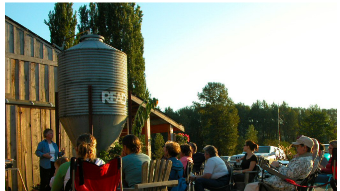
New Farmers learn from the experiences of Fall City Farms.

•Fourteen Washington State counties offered Sustainable Small Acreage Farming & Ranching Overview Course with class sizes up to thirty farmers totaling 127 farmers to complete the course in 2006.